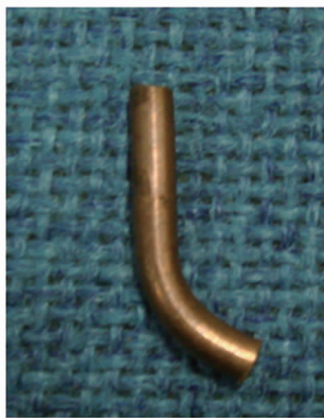
Figure 1 The artificial root canal model :A picture of the artificial canal made of pure copper.

and 60° respectively. The length was 16 mm and the radius of curvature was 5 mm, and the inner diameter was 0.7 mm (Figure 1).